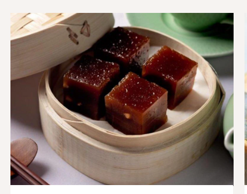
RED DATES CAKE A mildly sweet Chinese steamed cake made with red dates.

Contains glutinous rice flour, coconut milk (V)