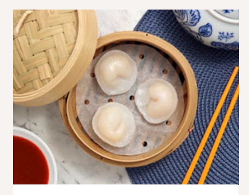
SCALLOP DUMPLING A translucent dumpling with a filling of Australian scallops.