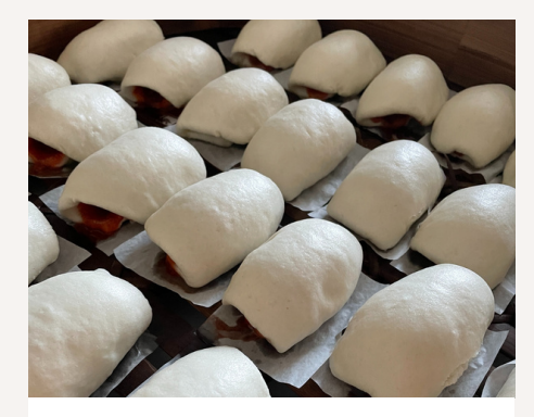
CHINESE SAUSAGE ROLL Chinese sausage wrapped in a fluffy white bun.

Contains black sesame, peanut, milk, gelatin, wheat flour