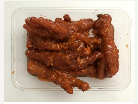
CHICKEN FEET A yum cha classic - flavourful and collagen packed chicken feet.