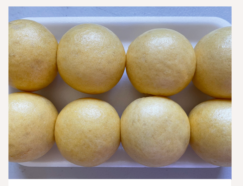
SALTED EGG LAVA BUN A very popular Cantonese fluffy yellow bun filled with a lava egg-yolk custard.

Contains egg, dairy, gelatin, wheat flour