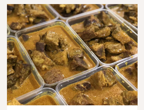
CURRY BEEF BRISKET

Tender curry beef brisket - serve with cooked rice, carrots and potato for a hearty meal.