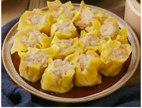
PORK SIU MAI Dim sum filled with pork wrapped in a thin pastry.

Contains beef, pork, mandarin peel, water chestnuts, coriander, wheat flour, egg, soy