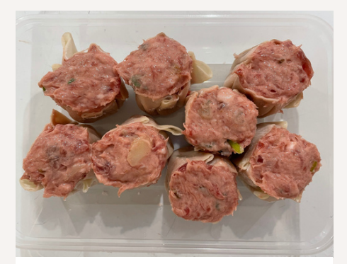
BEEF SIU MAI Dim sum filled with beef wrapped in a thin pastry.

Contains beef, pork, mandarin peel, water chestnuts, coriander, wheat flour, egg, soy